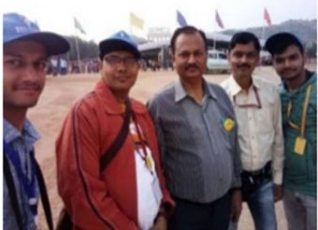
Students of Birla Shiksha Kendra participated in the poster display and rally on Matyr's Day on January 30, 2020.