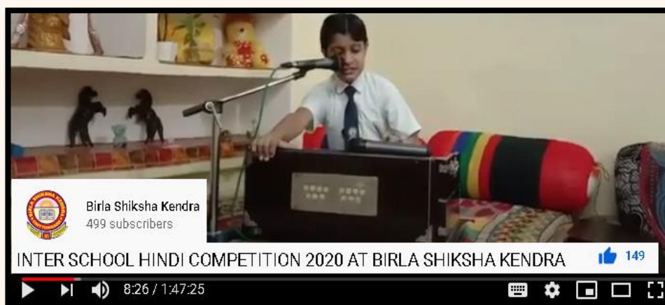
A screenshot from the video of the Interschool Hindi Competition , saved in official you tube channel.

https://www.youtube.com/channel/UCGlrAcP15NyoLew_unAtmVQ